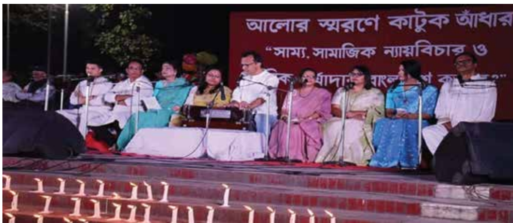
Alor Soroney Katuk Adhar

The theme of the event was ‘How far has Bangladesh progressed toward equality, social justice and human dignity?’