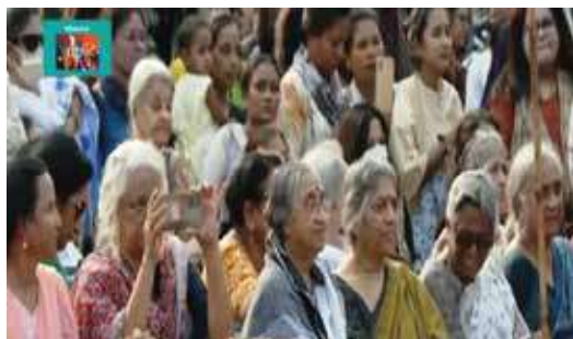
Solidarity March at the Call of Women

On 20 January 2025 at 4:00 PM, a protest programme was organized in front of the Naripokkho office condemning the attack on Indigenous students citizens. The programme strongly denounced the incident and demanded security, justice and protection of human rights for Indigenous communities.