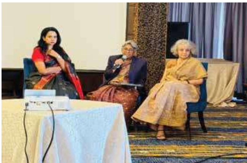
Global Consultation held on 4–5 February 2025 in Kuala Lumpur, Malaysia

International Advocacy: Through dialogues, UNHRC sessions, and regional/global consultations, Naripokkho and partners shared experiences, countered religious opposition, and built networks across South Asia, Africa, and beyond. Outcomes included stronger advocacy strategies, regional collaboration, and a roadmap for future action.