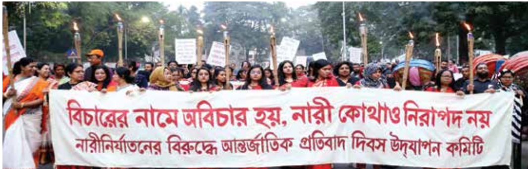
Procession of the International Day of Protest Against Violence Against Women

As in previous years, the International Day for the Elimination of Violence Against Women 2024 was observed on 10 Agrahayan 1431 / 25 November 2024 at 4:00 PM. The event was organized by the national observance committee, consisting of 51 organizations, under the theme: 'In the Name of Justice There is Injustice; Women Are Safe Nowhere.'