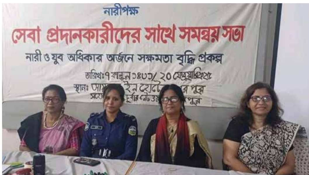
Coordination Meeting with Service Provider

Furthermore, to develop young women leaders, a special training on laws and policies was conducted. Participants gained knowledge on the Sexual Harassment Prevention Policy 2009, Domestic Violence (Prevention and Protection) Act 2010, Child Marriage Restraint Act and other relevant laws and developed team-based action plans to prevent violence. Twenty-five young women participated in this training.