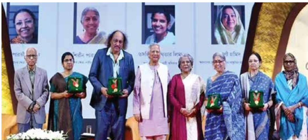
The Chief Adviser with the recipients of the Begum Rokeya Podok-2024

Dr. Yunus stated in his own address: 'This medal is not for a recent achievement. It recognizes their lifelong sense of duty and inspiration, to which they have devoted their lives. It is an example for the entire nation'