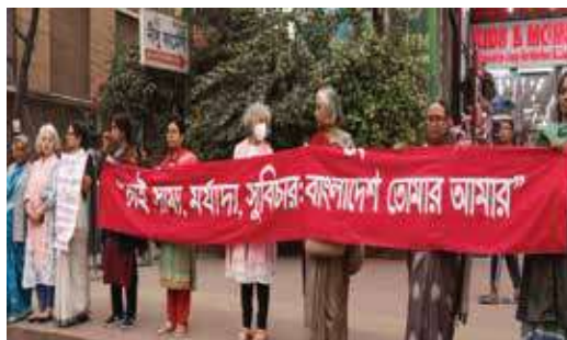
Naripokkho reaffirmed its committment in support of peace, justice and humanity