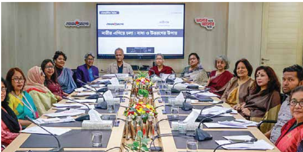
A Roundtable Meeting titled “Women Gaining Ground: Barriers and Ways to Overcome Women” organized by Naripokkho and Prothom Alo.

To establish women's rights and gender equality, Naripokkho has been consistently conducting advocacy activities aimed at implementing the recommendations of the Women's Reform Commission. As part of this process, the organization engages in meetings with policymakers, awareness-building through the media, publication of research and data, discussions with civil society and advocacy in different forums highlighting the need for policy reforms.