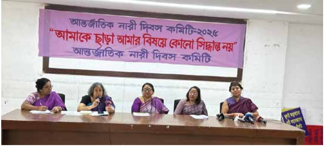
Press Conference of International Women's Day Committee

In line with the national committee's theme, press conferences were also organized simultaneously in 18 districts by women's networks Doorbar Network and Bonhishikha. This coordinated initiative strengthened advocacy and public awareness on the issue at both national and local levels.