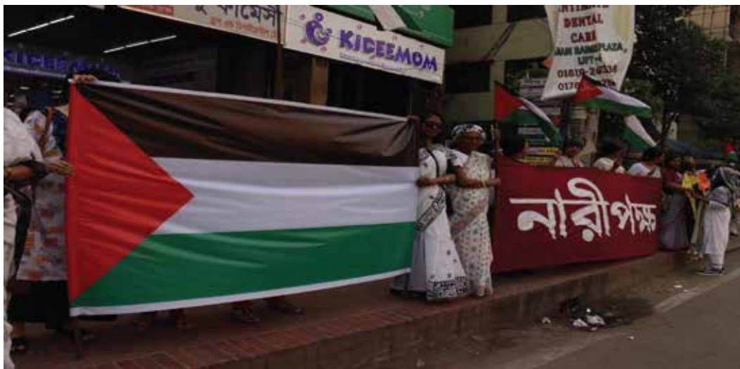
Programme in Protest Against Brutal Attacks, Genocide and Aggression in Palestine

On 7 April 2025 at 4:00 PM, Naripokkho organized a solidarity protest in front of its office in support of the Global Strike against violence in Palestine. Naripokkho reaffirmed its commitment in support of peace, justice and humanity. The programme protested the ongoing brutal attacks, genocide and aggression in Palestine by Israel and called for the protection of international human rights standards.