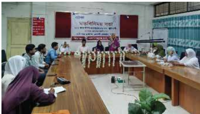
Hospital Management Committee meeting in Patuakhali district

Networking and Coordination: Three networking meetings with 16 organizations (108 participants) were held, attended by RRRC and camp officials. Authorities committed to supporting women’s and adolescent groups, and four Rohingya volunteers gained employment, expanding project impact.