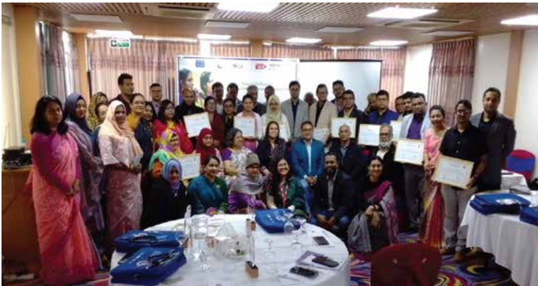
Meeting with high-level mgt of the garment industry with the Shojag Coalition and certificate distribution

The project “Promoting gender justice for women workers in the Readymade Garment Sector” was a 36-month initiative (January 2022 – December 2024) funded by the European Union and implemented in Savar, Kaliakoir, Gazipur Sadar, Mirzapur and Valuka. The project aimed to prevent violence against women in the workplace, particularly in the ready-made garment industry and sought to reduce violence against women in garment factories and public spaces while promoting gender equality. It also focused on strengthening the capacity of women-led organizations (CSOs) working to protect the rights of women garment workers.