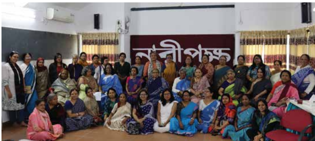
Group Photo of members of Naripokkho

The Annual Discussion Meeting of Naripokkho was held on 14–15 Agrahayan 1431 / 29–30 November 2024 at CCDB Hope Foundation, Savar. A total of 50 members participated, including 15 members from Noakhali, Jessore and Rajshahi.